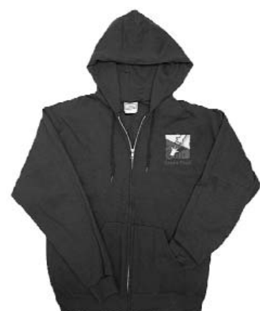
Convention Logo Hoodie (See order form above)

The members of Al-Anon cordially invite you, the relatives and friends of those affected by the family disease of alcoholism, to Al-Anon's participation in the 46th Annual Area 45 General Service Convention of Alcoholics Anonymous. Please join us in finding happiness, even contentment, whether the alcoholic is still drinking or not. For more information call Al-Anon South Jersey Information services.